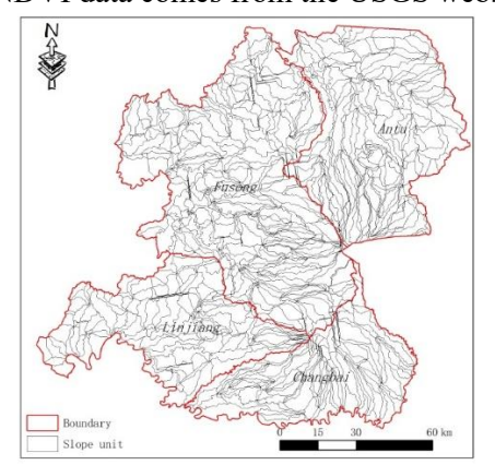
Figure 1. Slope Unit Map of Changbai Mountain Area

the NDVI data comes from the USGS website.