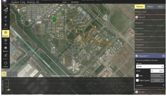
Figure 4.QGroundControl Interface Schematic

QGroundControl, an open source simulation environment for flight control of multiple aircraft [5]. It allows operators to build complex tasks, including tasks and other program items, by adding a task designer.