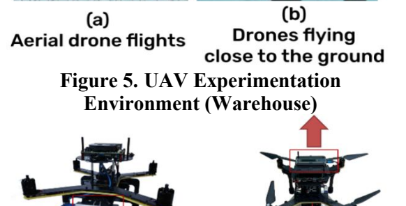
(a) (b) T265 placed downward T265 placed up Figure 6. T265 Placement Down and Placement Up

We put the drone in the experimental field with everything ready, and we will experiment five times with both T265 placement modes. We set up five coordinate points, including the drone's left-right movement and up-down movement to test it, and the image received by the T265 fisheye camera will be changed in the process of moving. We will write the written speed and path into a program, and control the attitude of the aircraft through the PX4 flight controller, fixed-point cruise, at the same time, if a Slam error occurs, there will be obvious prompts, and at the same time, the probability of coordinate drift, which means that the UAV does not follow the prescribed route.